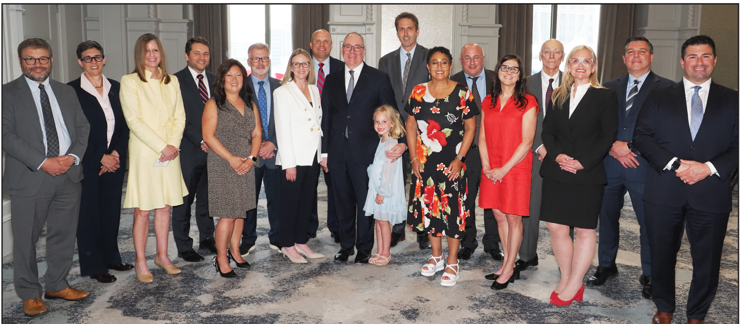
Annual Dinner Attendees