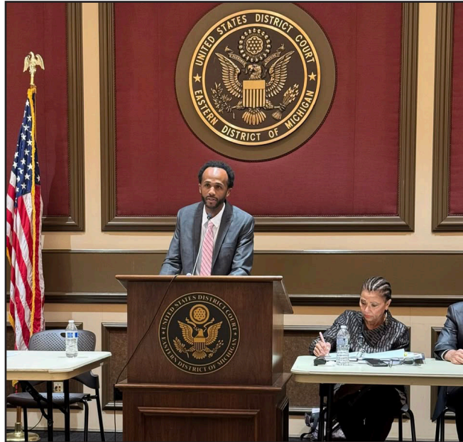
Prisoner Mediation Training hosted by the Pro Bono Committee.