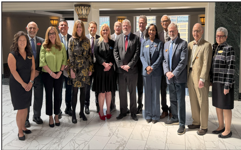
Gilman Luncheon Attendees.