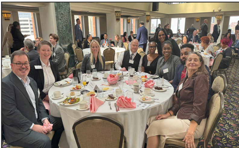
Gilman Luncheon Attendees.

Executive Director, Eastern District of Michigan Bar Association