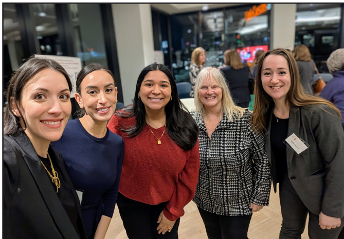
Women Helping Women Attendees.