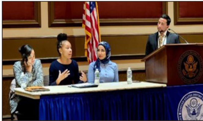
Classroom to Courtroom Attendees.

The event was a resounding success, and many students expressed an interest in interning and clerking at the Court. The Diversity Committee thanks all participating judges, panelists, and students for another wonderful event!