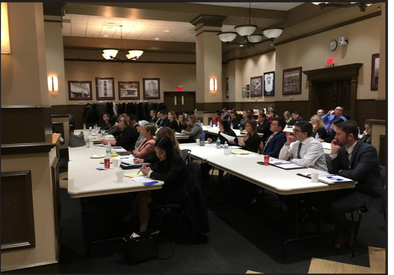
Participants at the New Lawyers' Seminar absorbing information on the first day of the seminar.