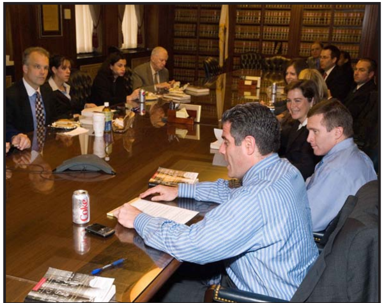
Book Club attendees at John Feikens Conference Center.