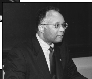
Larry Thompson, Deputy Attorney General