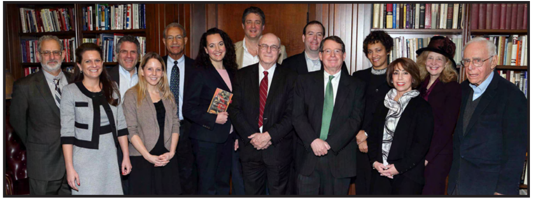
Book Club attendees.