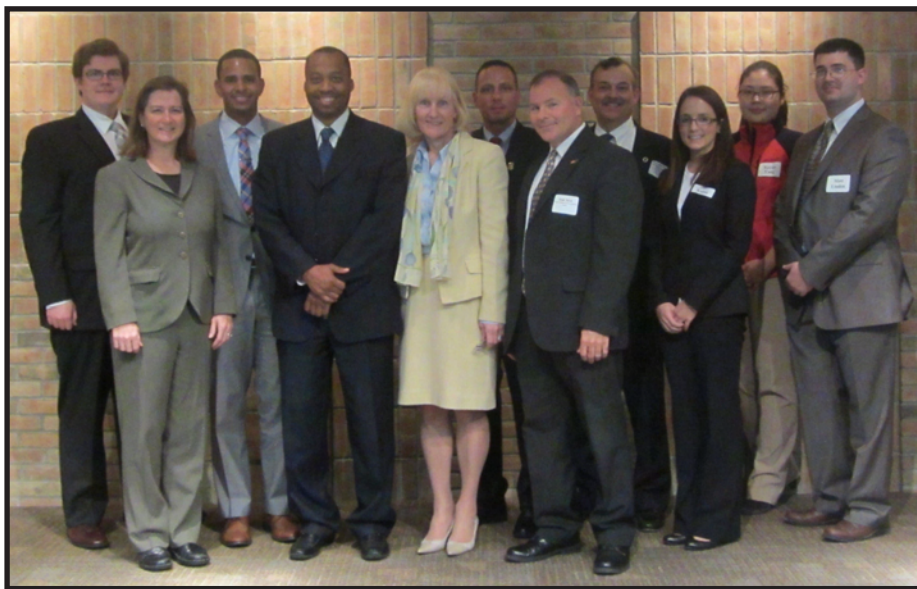
Attendees at the 2nd Annual Federal Youth Law Day.